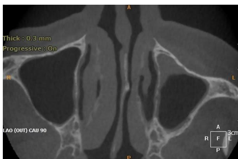
Figure 1 An axial CBCT image showed an example of a non-investigated left sinus due to pathology

All CBCT images were viewed and evaluated on the picture archiving and communication system (PACS) software (Infinitt® software, Infinitt Healthcare Co. Ltd., Seoul, Korea). The parameters regarding patient's data (age, sex, status of dentition of the investigated side: dentate, partial edentulous, edentulous), maxillary sinus septum of more than 2.5 mm in height, type of septa (sagittal, coronal, axial, others) (Fig. 2), the maxillary sinus wall that the septum originated from (floor, roof, medial, lateral, anterior, posterior), the number of septa in the sinus, the location of the septa (anterior: premolar, middle: first and second molar, posterior: third molar) (Fig. 3) and the completion of the sinus (complete: cross one wall to the opposing wall, incomplete) were reviewed from the software by two observers. Prior to the observation, a calibration session to be familiar with the software and the collecting data was performed. Twenty percent of the included CBCT scans were randomly re-evaluated after four weeks.