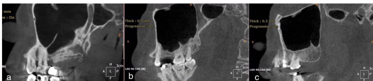
Figure 3 Locations of septa: (a) A sagittal CBCT image showed an example of sinus septa in the anterior region in the left maxillary sinus. (b) A sagittal CBCT image showed an example of sinus septa in the middle region in the left maxillary sinus. (c) A sagittal CBCT image showed an example of sinus septa in the posterior region in the left maxillary sinus